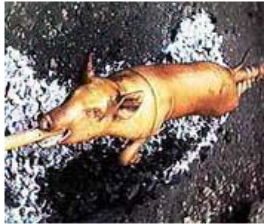
How to roast a perfect pig